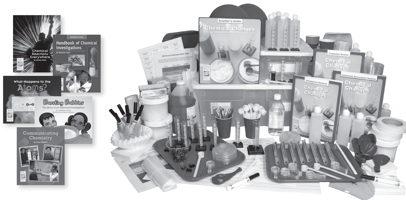
Chemical Changes Science and Literacy Kit

To learn more about Seeds of Science / Roots of Reading ® products, pricing, and purchasing information, visit www.seedsofscience.org